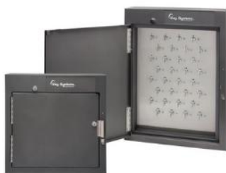
Direct Control SAM™