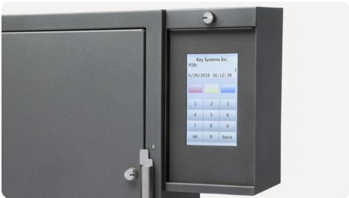
External Touch Screen