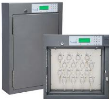
Security Asset Manager™

Key Systems, Inc. offers several styles of electronically controlled cabinets to store, audit and manage your keys and assets. You can personalize these devices to secure a wide variety of sensitive items. However, keys remain our customer's focus for asset retention.